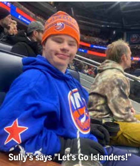
Sully's says "Let's Go Islanders!"