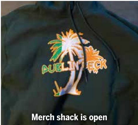
Merch shack is open