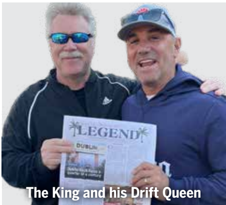
The King and his Drift Queen