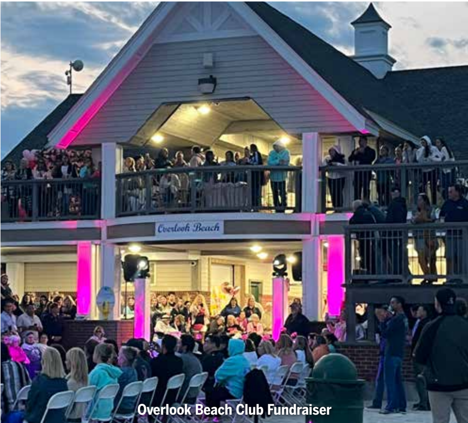
Overlook Beach Club Fundraiser