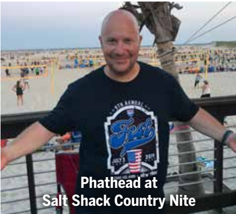
Phathead at Salt Shack Country Nite