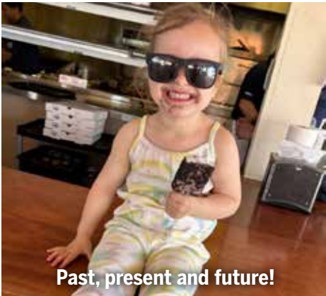
Past, present and future!