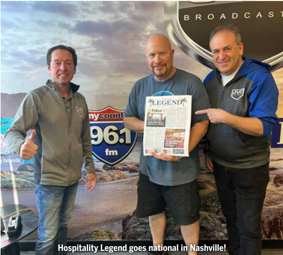
Hospitality Legend goes national in Nashville!