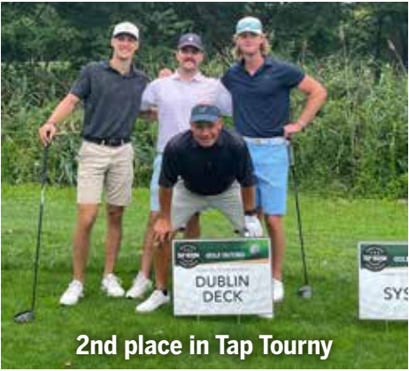
2nd place in Tap Tourny