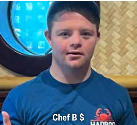
Chef B $