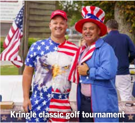
Kringle classic golf tournament