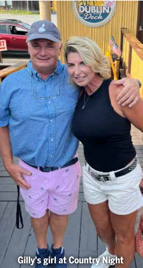
Gilly's girl at Country Night