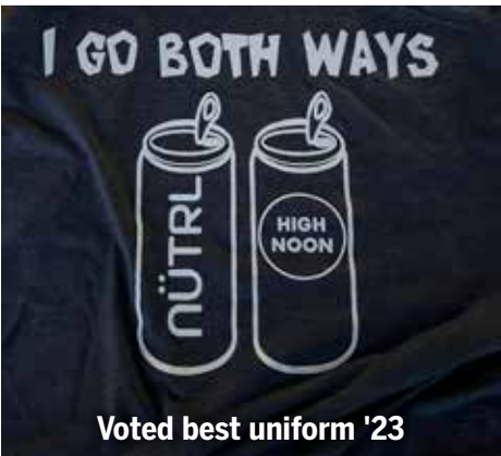
Voted best uniform '23