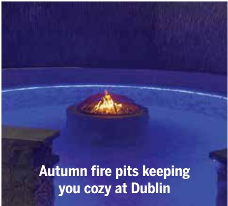
Autumn fire pits keeping you cozy at Dublin