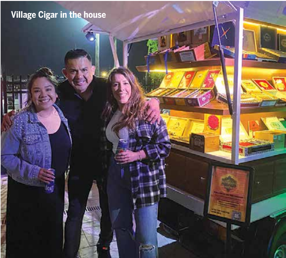
Village Cigar in the house