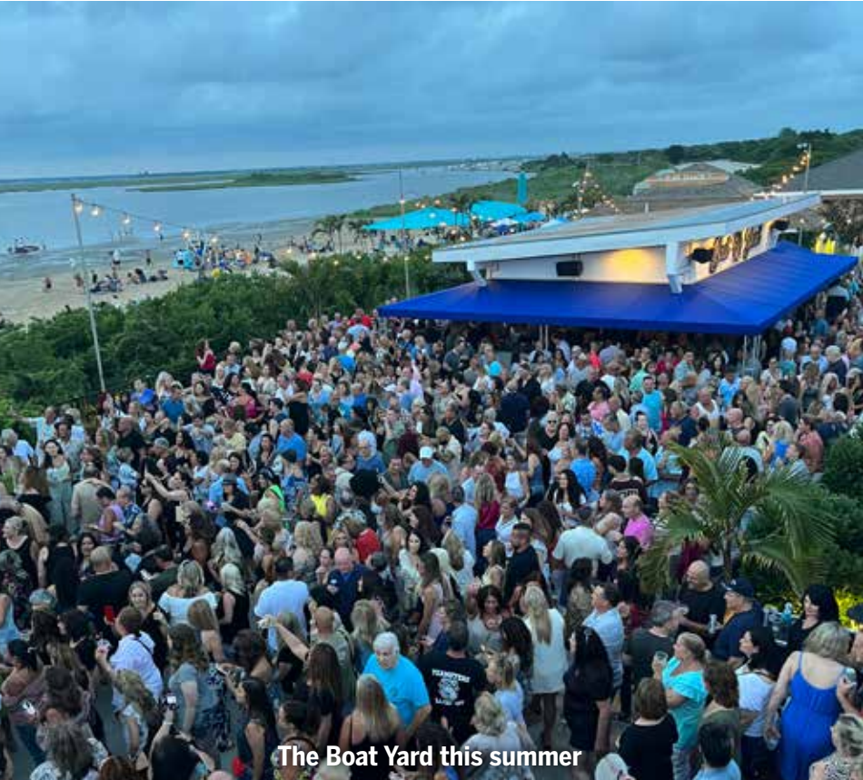
The Boat Yard this summer