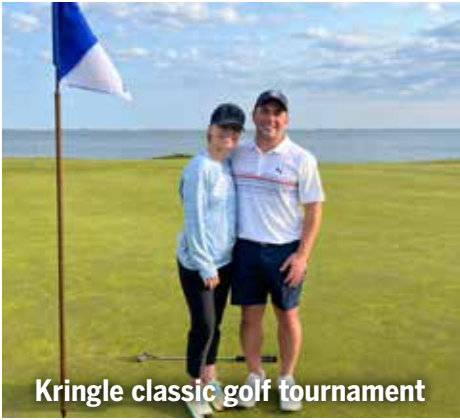
Kringle classic golf tournament