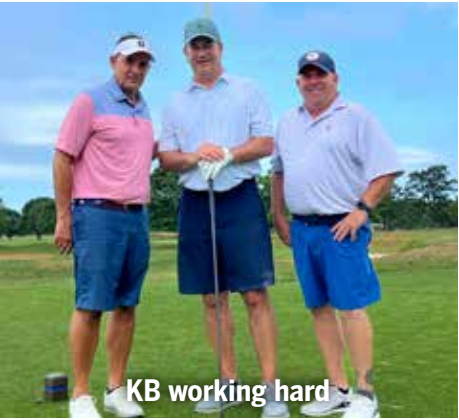
KB working hard