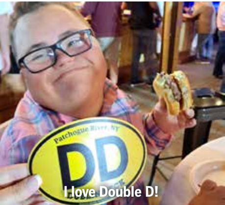
I love Double D!