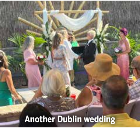
Another Dublin wedding