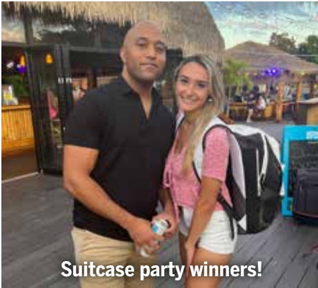
Suitcase party winners!