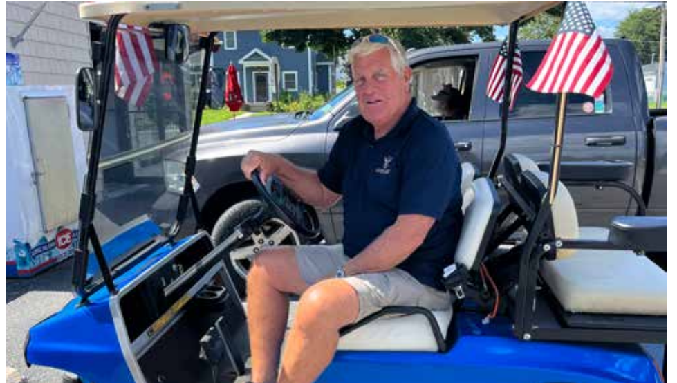
Retired Navy Seal quick to aid partner being assaulted outside deli.