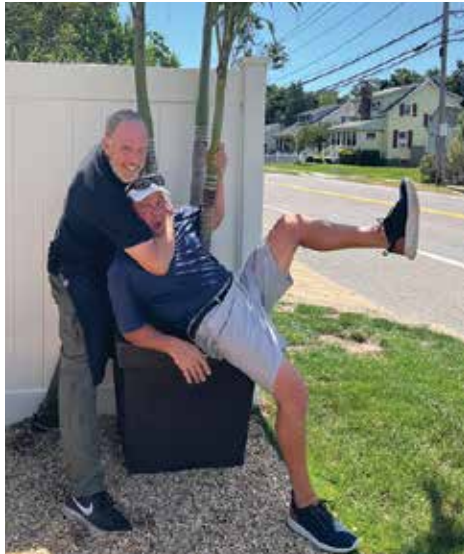
Deli Guy chokes out rightful owner of stolen palm tree