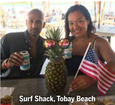
Surf Shack, Tobay Beach