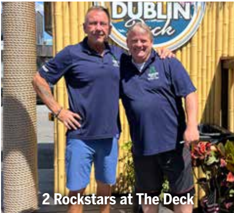
2 Rockstars at The Deck